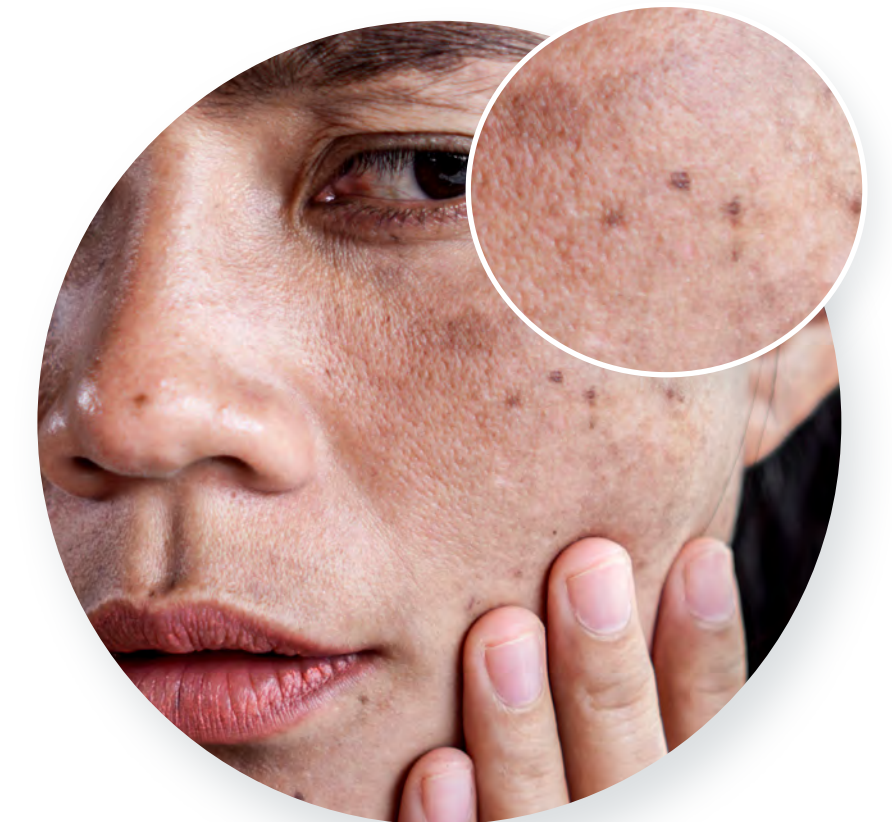
Mild to severe dark spots