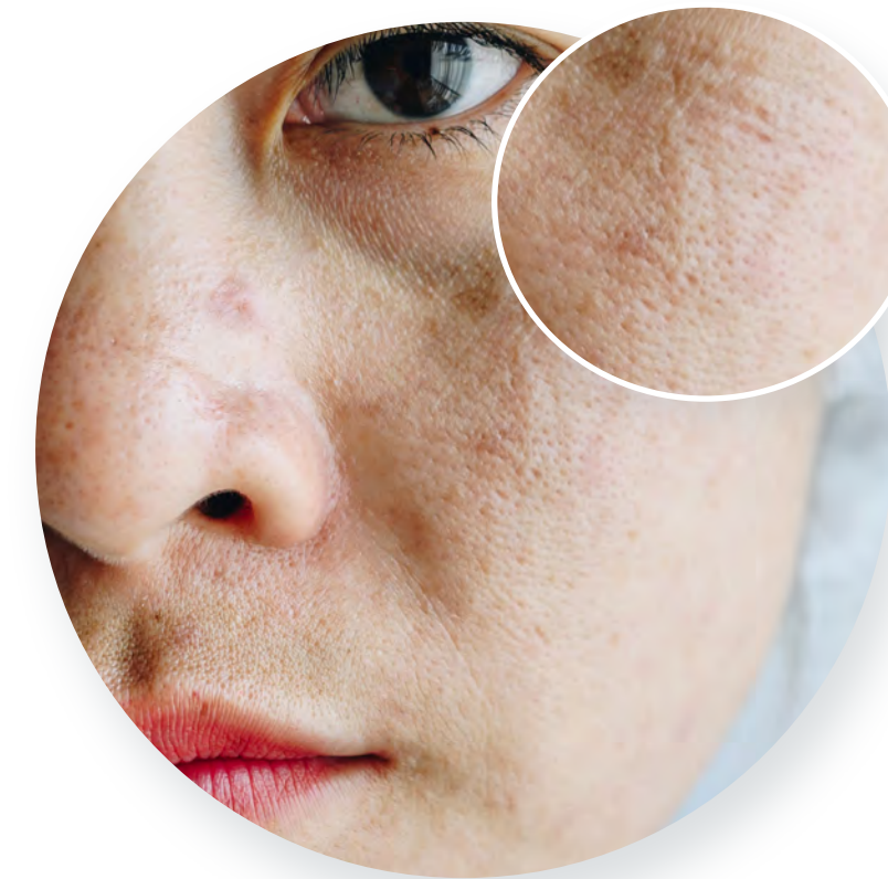
Mild to moderate textural irregularities

A buildup of dead skin cells, dirt, and chemicals on the face over time paired with pollution and sun exposure can exacerbate textural irregularities. 13