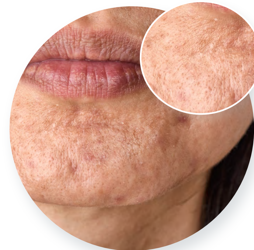
Mild to moderate dark spots

➡ Dark spots are very common and a natural part of aging but are increased with sun exposure. 10